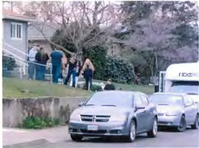
Photos from the morning of Sunday April 16, 2023. The photos show West 20 th Street in The Dalles, looking westward, as well as the bus parked along the eastbound shoulder of the street. The bus belonged to the short terms renters at 322 West 20 th Street and was ultimately loaded that morning with about two dozen kids and adults from 322 West 20 th Street.