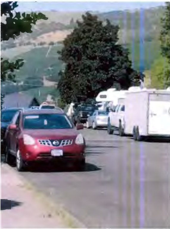
Photo from the morning of Sunday May 21, 2023. The photo shows West 20 th Street in The Dalles, looking westward, as well as the vehicles parked along both shoulders of the street. This portion of West 20 th Street is a two-lane cul-de-sac and is within a Low Density Residential zone. Several of the vehicles belonged to the short-term renters at 322 West 20 th Street. The street cannot safely sustain two-way traffic with this level of congestion, especially if emergency vehicles need to respond to this location.