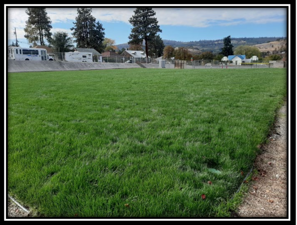
CWE Field After Sod