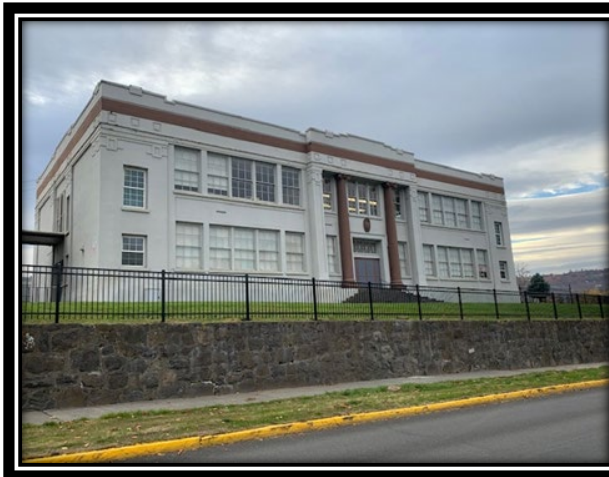
CWE Rod Iron Fencing Along 14th Street