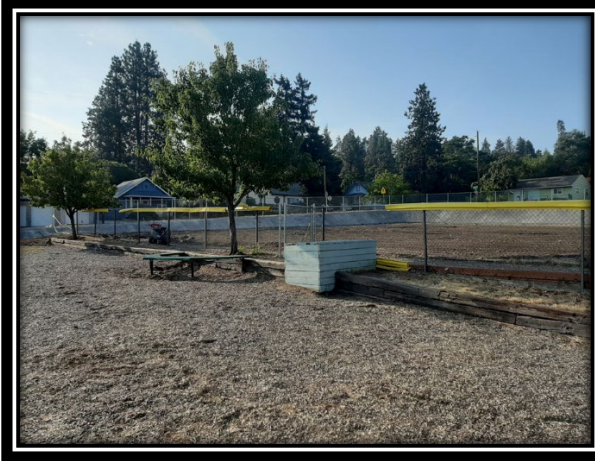
CWE Field Before Sod