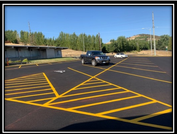
DHE Front Entrance (building painted) and Parking Lot