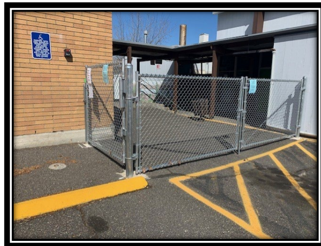
CWE Parking Lot Entrance