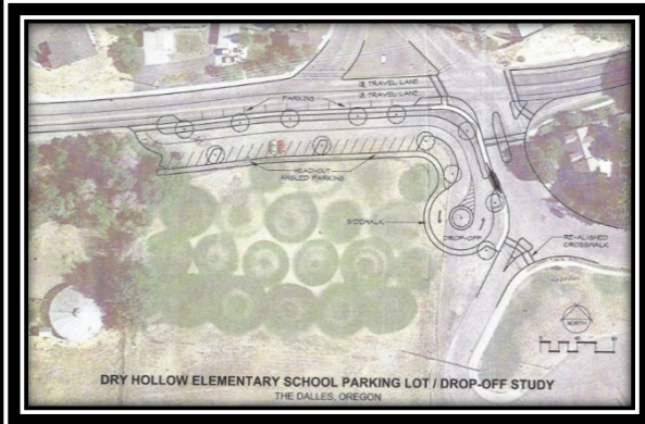
Final Conceptual Layout

Here are some of the improvements actually made to the upper parking lot at Dry Hollow: