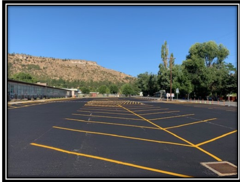
CES Parking Lot

The district closed off a portion of the parking lot at Chenowith Elementary to assist with traffic flow and repainted the building. The parking lot was refinished with striping.