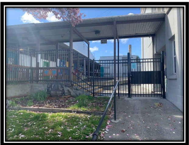
New Rod Iron Locking Gate at CWE