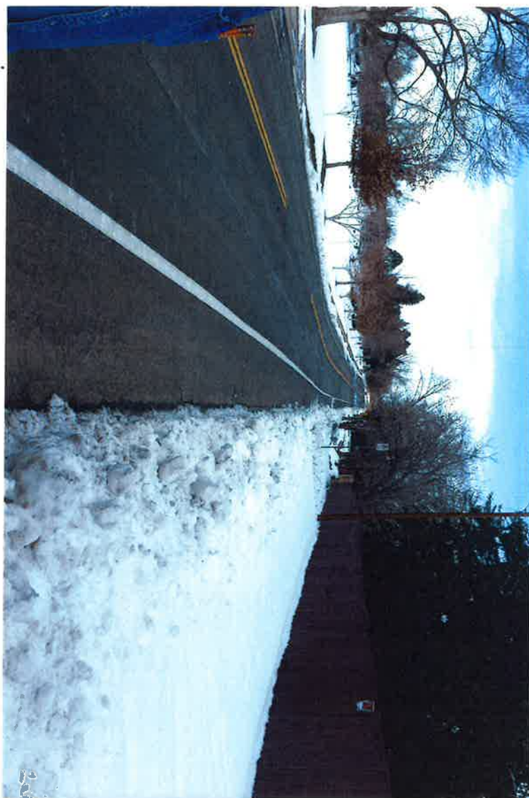
#2 PHOTO JUST SOUTH OF #1 MORE THAN 20' EAST OF GALLUP