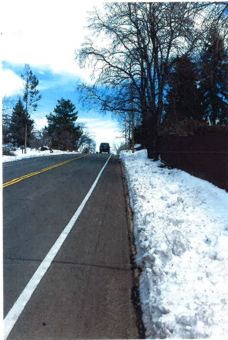
#6 LOOKING NORTH ALONG GALLUP ~ 8' EAST OF GALLUP