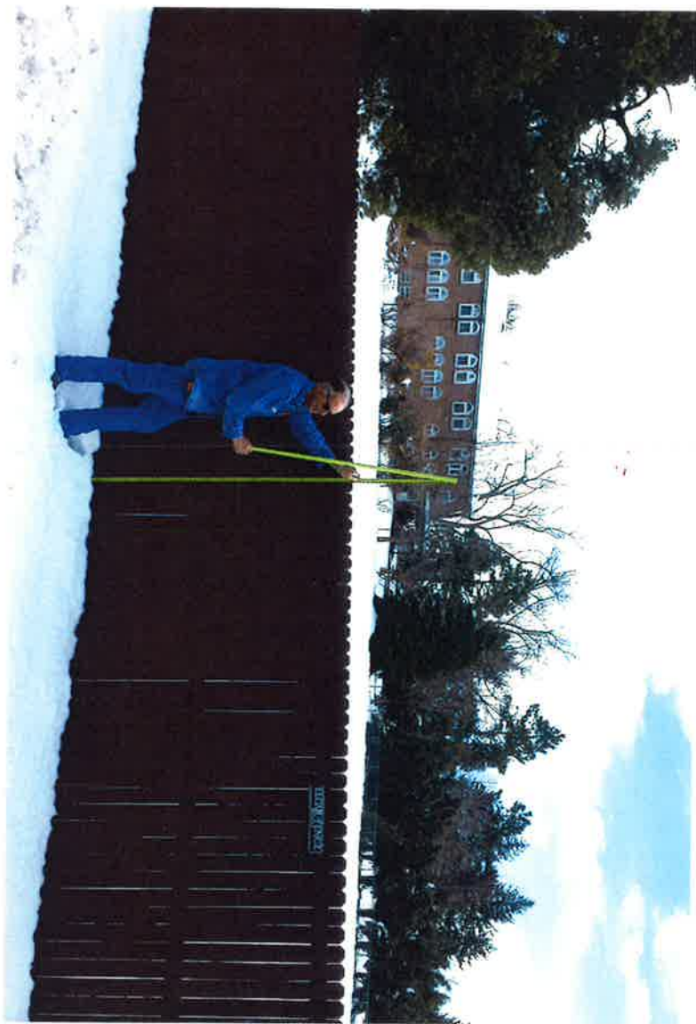
#5 PHOTO TAKEN FROM WEST SIDE OF GALLUP. THE TOP OF THE TAPE IS 8' TALL ~ 10' EAST OF GALLUP