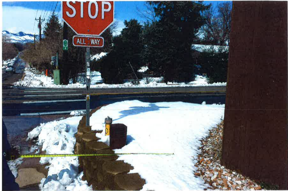
#11 NE CORNER OF CALY & GALLUP (5' OF TAPE)