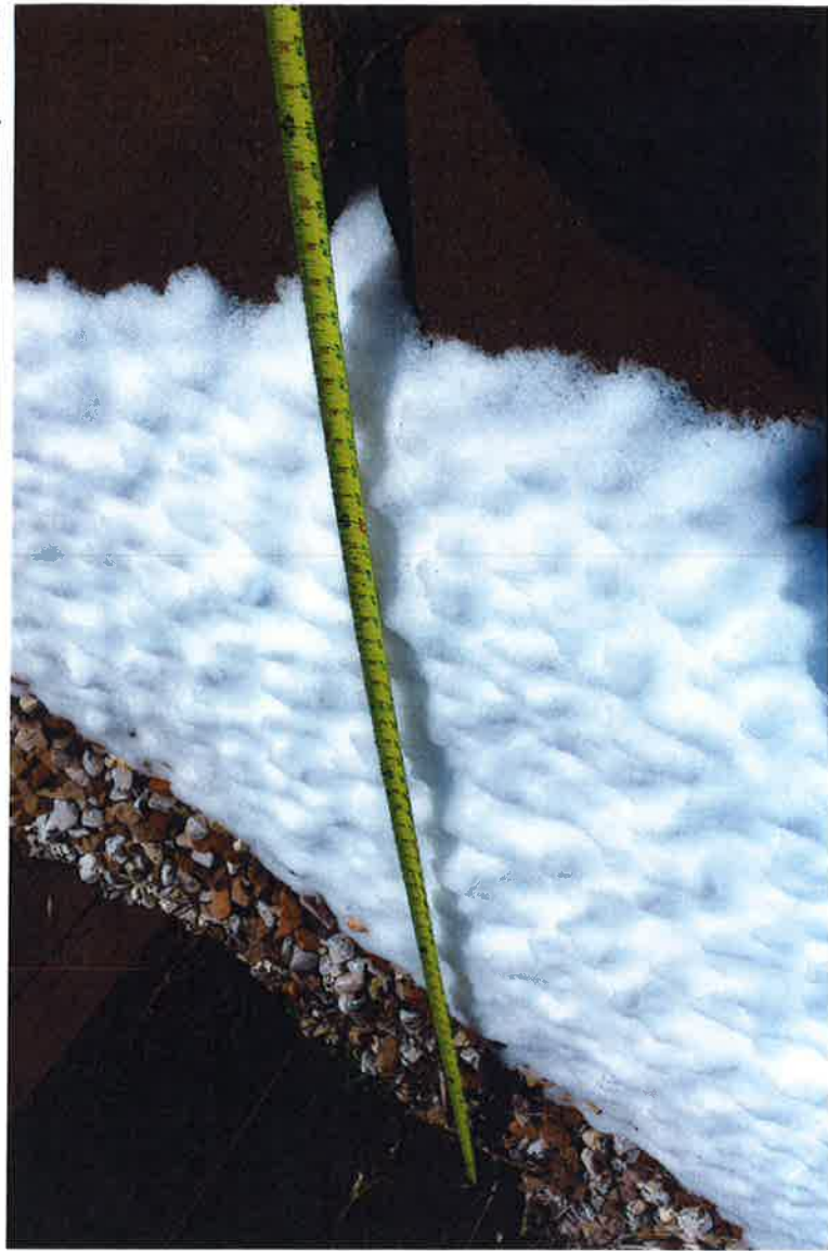
#8 SW CORNER OF LOT 5' MEASURED TO FENCE