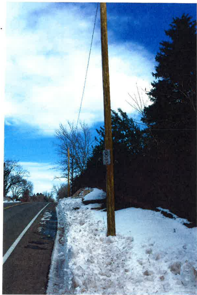
#4 MIDWAY ALONG GALLUP ~15' EAST OF GALLUP