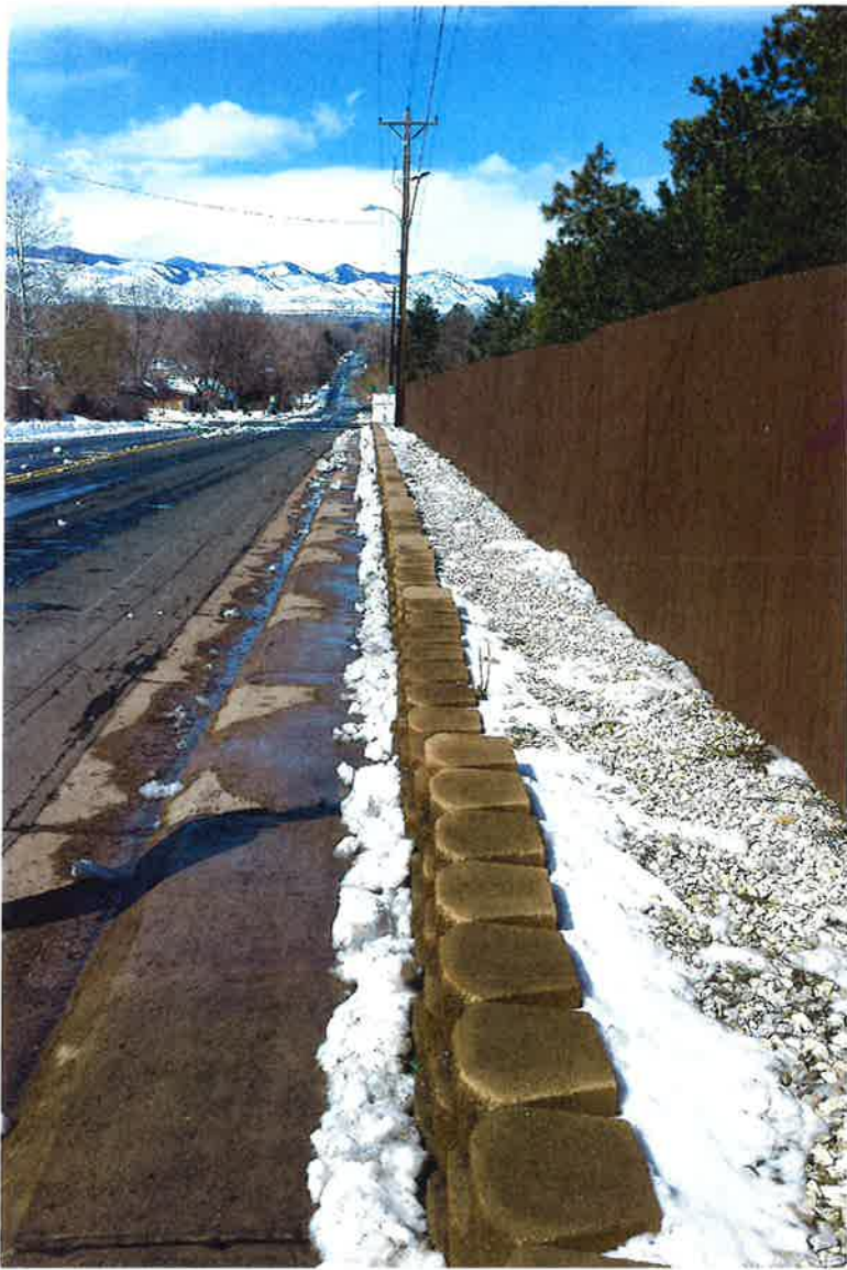
#7 SOUTH SIDE ALONG E CALEY FENCE SET BACK FROM 18" PAVERS A 5' NORTH OF CALEY PROPERTY LINE