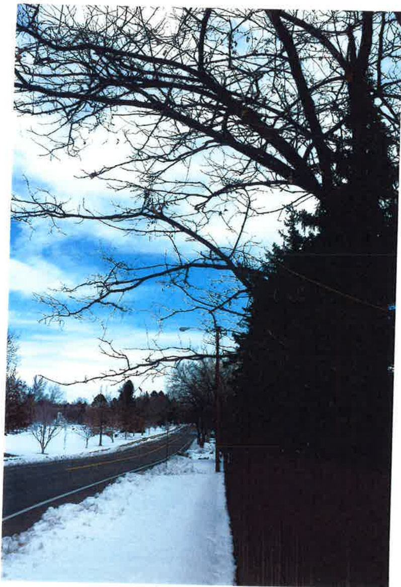
#1 NW SECTION OF FENCE (ALONG GALLUP) ≈ 25' EAST OF PROPERTY LINE