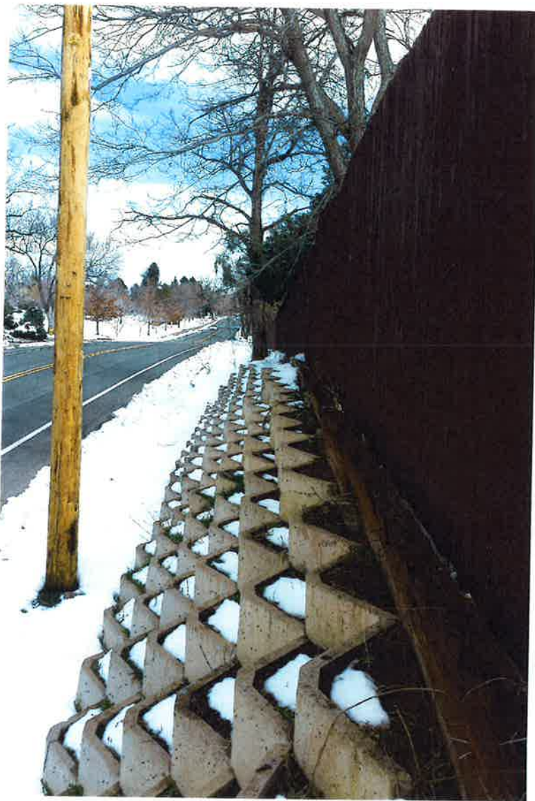
#3 18' EAST OF GALLUP