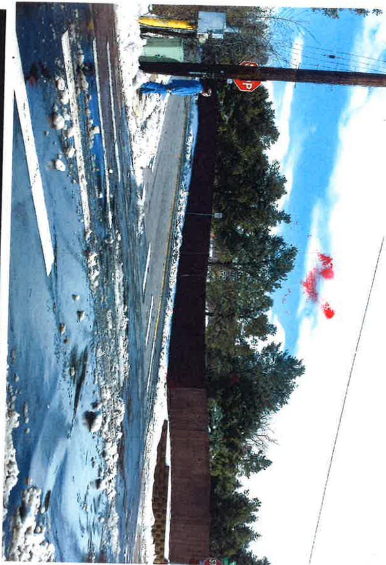
#10 TAKEN FROM SW CORNER OF GALLUP & CALEY