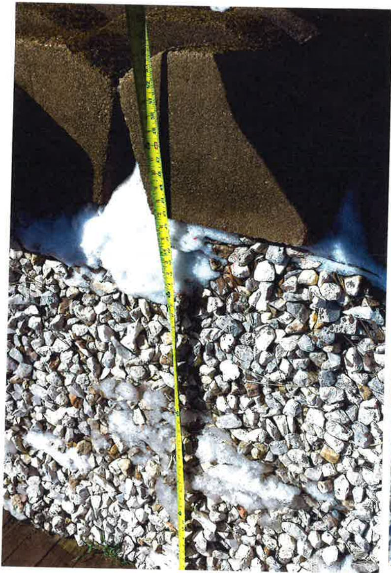
#9 \approx 5' NORTH OF CALEY PROPERTY LINE